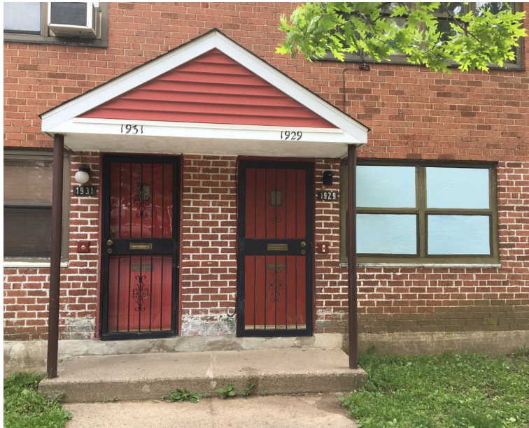
Door and windows repainted over plywood. 1929 N. Warnock Street.