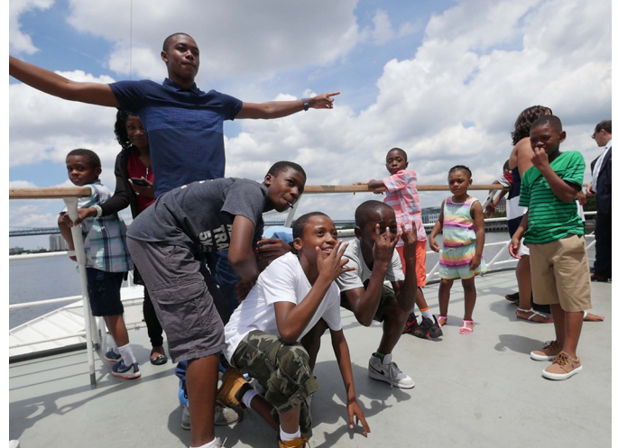
Norris Summer Camp field trip on The Spirit of Philadelphia.

Will become a key part of ongoing documentation of the community that will continue past the life of the grant.