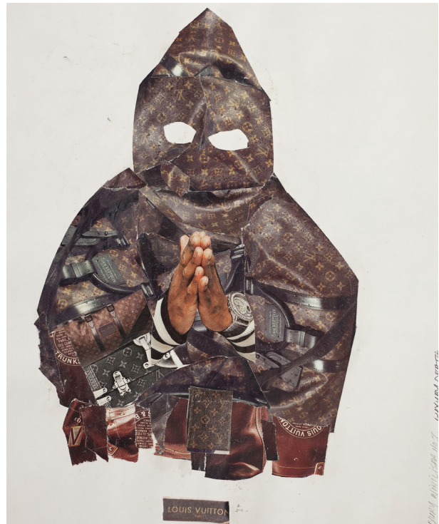
James "Yaya" Hough, Untitled , 2015, Paper collage, 8.5" x 11"

Two recommendations were raised for how organizers might leverage the catalytic potential of a program like the RRF even further. First, for artists trying to use their work to shift policy and build movements, organizers could consider investing in targeted supports that amplify specific projects' impacts, build capacity for the artist, and situate the project in a longer continuum of action. Types of support might include bringing filmmakers, social media experts, issue advisors, and community organizers onto the project. Second, organizers should view specialized fellowships, like the RRF, as a pipeline to future partnerships with these artists, whether in the same area of focus or outside of it. Although all of the RRF artists are deeply committed to the issues they work on around the justice system, several voiced their interest in being considered for project opportunities with a diverse array of objectives and themes. One fellow shared, contemplating their future, "You can get caught up in this thing where you become the criminal justice reform go-to person, and you can't grow as an artist."