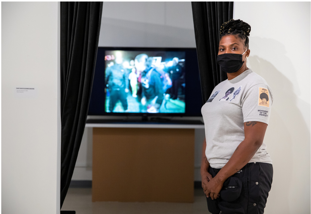
Prophesied dedication, and Rendering Justice opening event the African American Museum in Philadelphia, 701 Arch Street, October 28, 2020.