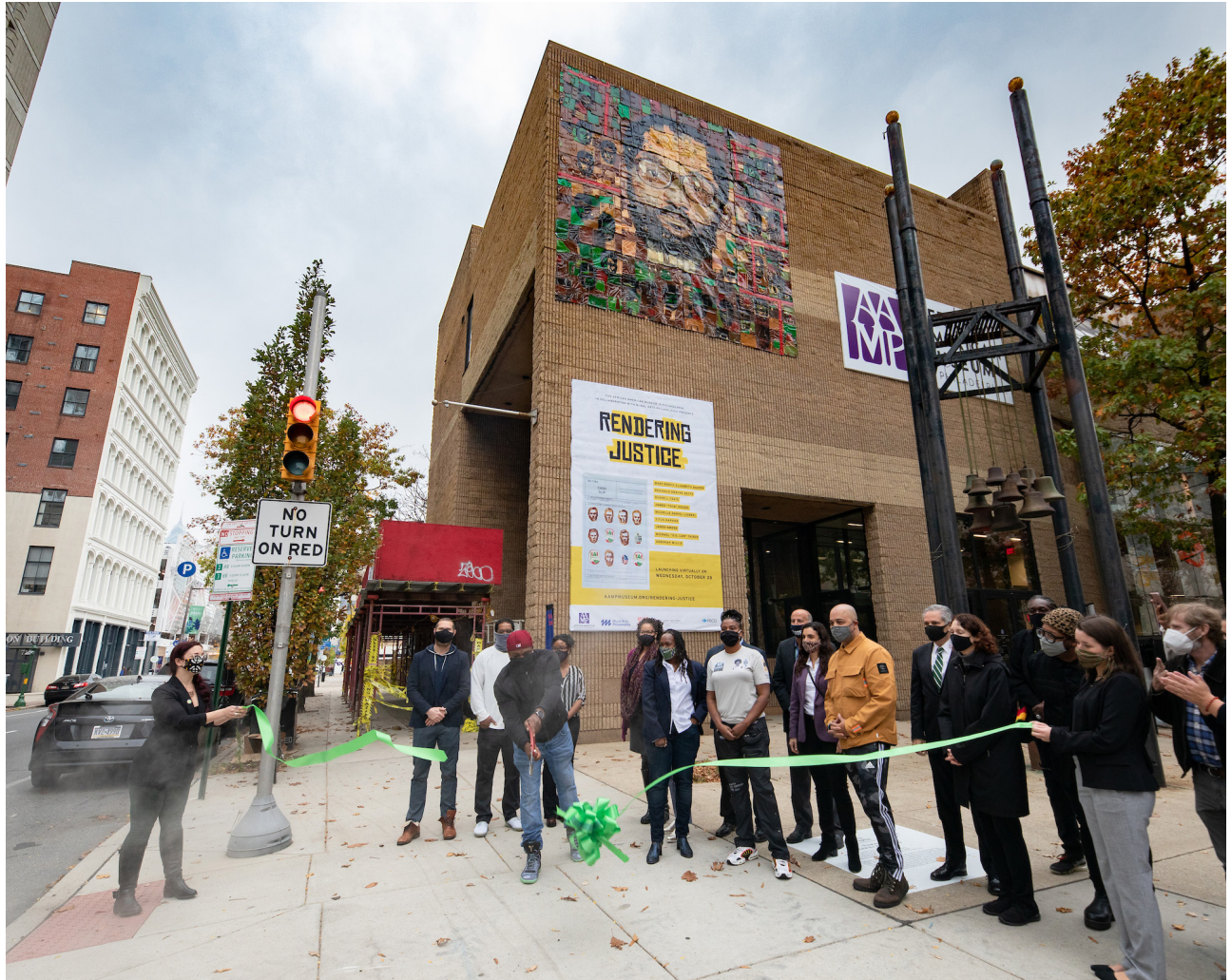
Prophesied dedication, and Rendering Justice opening event the African American Museum in Philadelphia, 701 Arch Street, October 28, 2020.