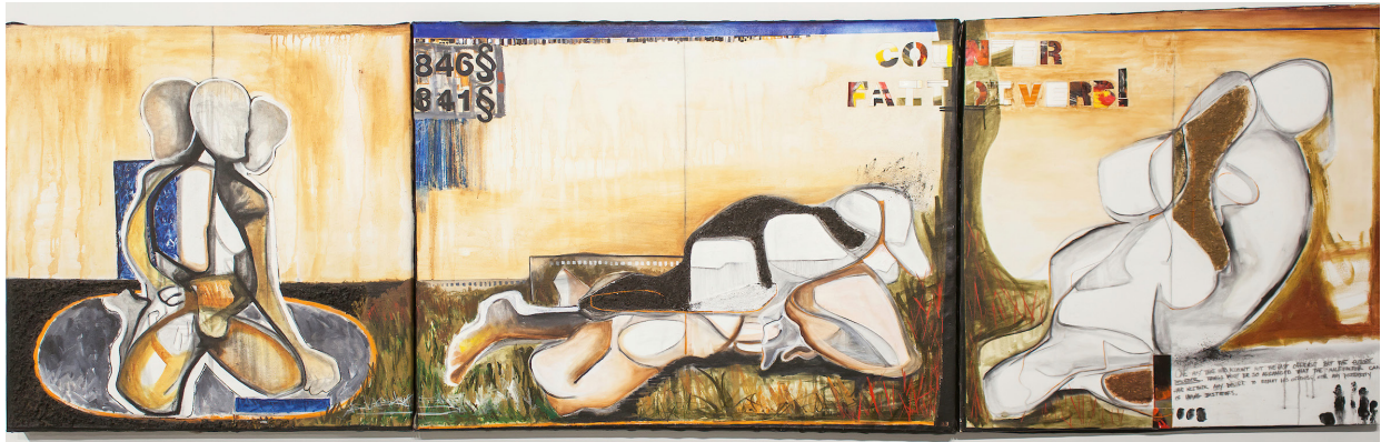
Jared Owens, bête noire , 2012, Prison-yard dirt, gravel, acrylic paint, 120" x 60"

The specific focus of each fellow's project is shared here, as well as a description of their processes.